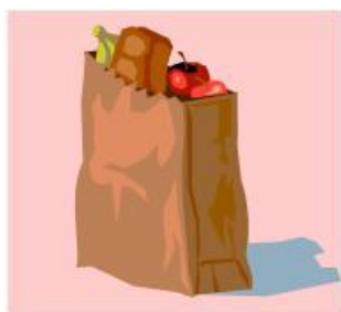
Kenwood Park SHARE Iowa News

In order for this to happen regularly, orders of 50 or more units must be taken for at least 3 months straight. Orders taken for this period until July 11 are down a bit, so everyone needs to participate this month to keep this direct delivery service.